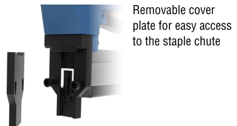
Removable cover plate for easy access to the staple chute

Vibration level Vibration below the limit of declaration according to EN 792-13 measured according to ISO 8662-11